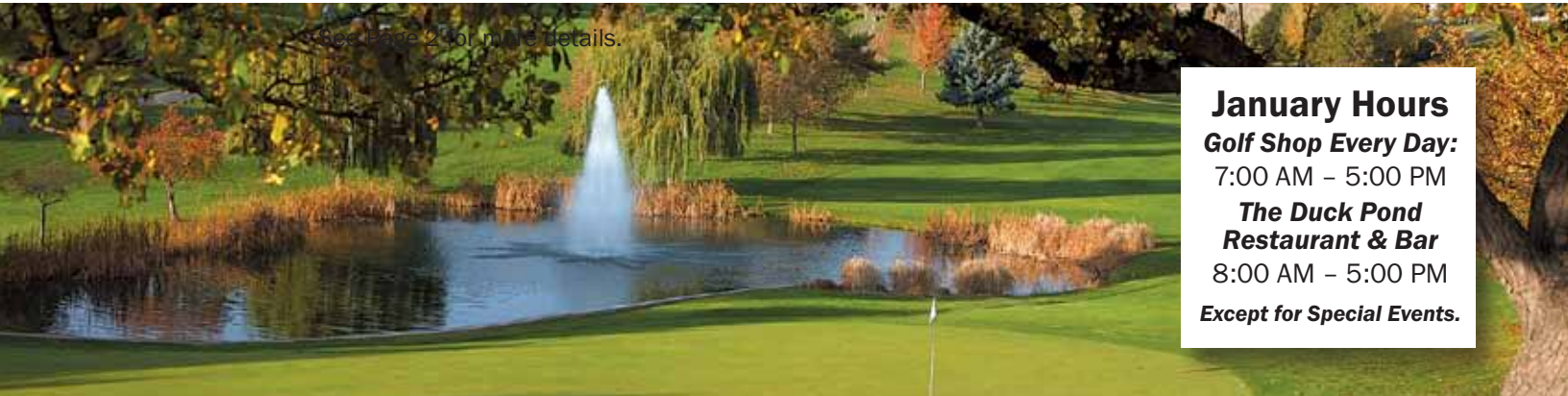
See Page 2 for more details.